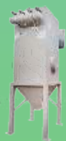
脉冲粉尘集电极 Pulse Dust Collector