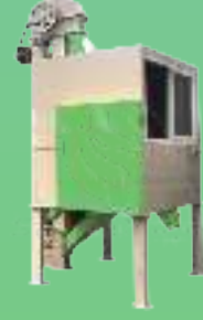
静电分选 Electrostatic Separation