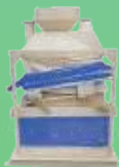
空气比重分选床 Air Gravity Separator